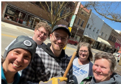
Staff Volunteered at Downtown Boone Clean Up Day