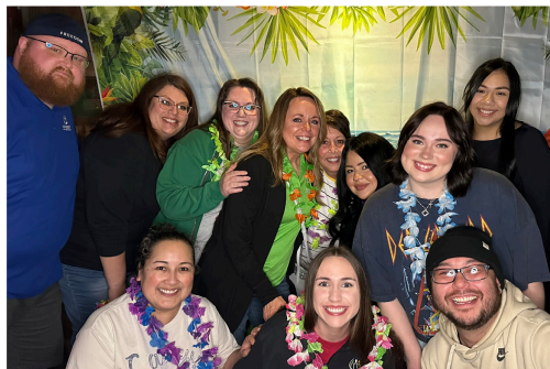
Marshalltown team raised money for Big Brothers & Big Sisters at the Bowl for Kids' Sake event